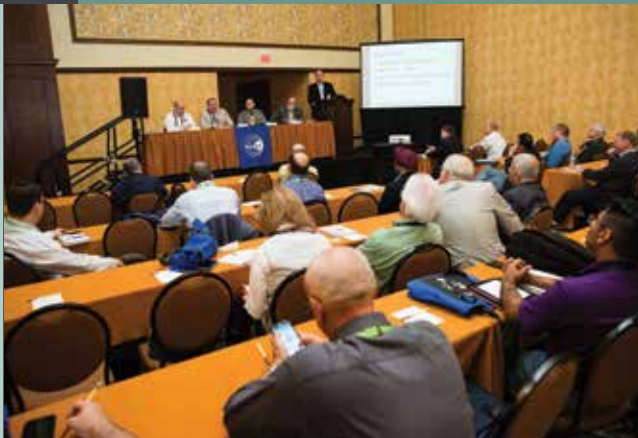
Interactive roundtable discussions were a highlight of NASTT's No-Dig Show Technical Program in 2016, facilitating great dialogue between attendees the expert panels that covered a variety of trenchless topics.

pressure pipe inspection, pipe rehabilitation and the past, present and future of CIPP and more.