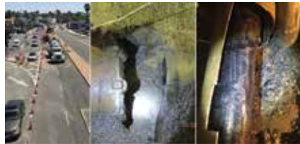
Figure 5 – Rescue shaft in the middle of Pacific Coast Highway (left) to access the MTBM that indented the steel casing (middle) housing the high-pressure gas main (right).

On the fourth night, the arduous effort finally made it to tunnel depth. It was observed that the MTBM was in direct contact with the now-dented steel casing that housed the high-pressure gas line. The concern for the construction team was the effect of the MTBM's collision on the gas line. To find out, the gas company would need a larger, more stable excavation to open the casing and assess the pipe. With the moratorium only 33 days away, it was decided the battle was over and the MTBM would need to be extracted. A large excavation had to be extended to the back of the machine in this problematic location. Only one highway lane could remain for this work, with occasional complete closure in the north-bound direction.