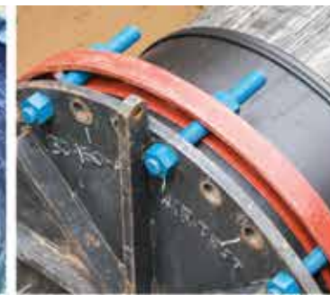
United Pipeline Systems