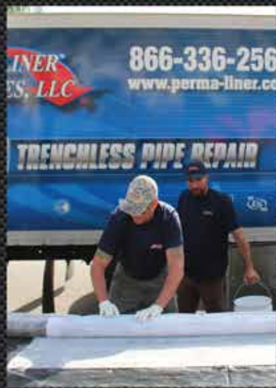
SECTIONAL POINT REPAIR