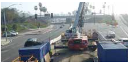
Figure 2 – View down the tunnel alignment from the launch shaft on Pacific Coast Highway.

The team eventually determined a tunnel on the order of 1,000 ft (305 meters) long would be needed to “clear” the interchange area between acceptable locations for launching and receiving shafts. The use of HDD and auger boring were deemed unsuitable due to the required machine pressures, preventing inadvertent returns potential, handling of groundwater, and reducing ground loss in flowing sands and mixed face conditions. This left slurry microtunneling as the most viable solution. A two-pass methodology [48-in. (1220-mm) steel casing plus 32-in. (813-mm) HDPE carrier pipe] was identified and also found to be acceptable to Caltrans.