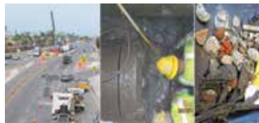
Figure 3 – Rescue shaft (left) to remove reinforced concrete obstruction (middle) and debris (right) from tunnel alignment.

dow of overnight work between 8 p.m. up until 11 a.m. or later if, at the city's daily discretion, traffic was not backing up. Actual exploratory work was reduced within this time period after accounting for the following activities: setting traffic control; removing traffic plates; establishing sump pumping; changing personnel; reestablishing traffic plates; and removing traffic control. As the rescue shaft was excavated, the contractor struggled to prevent soil from flowing into the pit and undermining the pavement. One sump was installed and two vac-trucks alternated to remove water from inside the excavation. These large vac-trucks filled in only 10 minutes as groundwater rapidly rebounded to approximately 7.0 ft (2.1 meters) below ground surface when only the sump was used. An adjacent gas line and a 20-in. (508-mm) diameter concrete pipe in the corner of the pit added significant amounts of water from the backfill around the pipes. When the MTBM was finally uncovered, it was revealed that a reinforced concrete wall extended to about 1-ft (305-mm) below the bottom of the cutter head with the MTBM resting on a concrete floor; likely the remnants of an abandoned Imhoff sewage tank foundation shown in Figure 3.