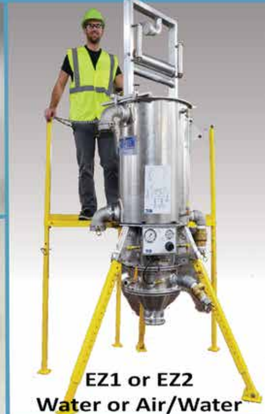
EZ1 or EZ2 Water or Air/Water