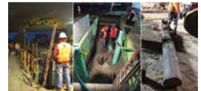
Figure 4 – Pile obliteration trench (left); exposed battered timber pile tips (middle); timber pile (right).

Exposing the piles became a battle as the contractor fought through flowing soil conditions and significant volumes of water. Ground Penetrating Radar (GPR) was performed concurrently in the area to enhance the team's knowledge of how far the excavation needed to extend. As the excavation lengthened, the construction team joked that every update from the field seemed to include the discovery of more and more piles; this dubbed the area to be known as the "underground forest." After eight days of trenching and breaking apart existing concrete pile caps, it was revealed there were four rows of piles within the vicinity of the tunnel on 4-ft (1.2-meter) centers (see Figure 4). In total, 16 piles had to be removed to clear the tunnel horizon at an enormous impact to traffic. Ground conditions only allowed the excavation to safely proceed deep enough to expose the top 3-4 ft (0.6-1.2 meters) of piles.