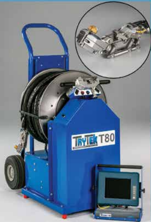
T80 3" to 6" Flex Cutter

Reinstatement Cutters • Inversion Units • Air Routers