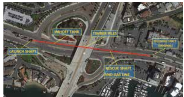
Figure 1 – Tunnel alignment along Pacific Coast Highway in Newport Beach, California.

fic control concepts and working hours to be observed as part of a constructible, permittable and maintainable solution. Regrettably, the city limited the number of soils borings and utility potholes to be performed during design and construction, preferring not to inconvenience the community. This decision would ultimately impact all stakeholders during construction.